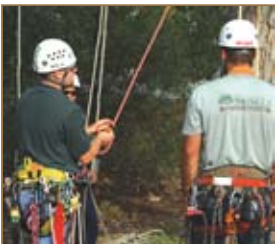
Advanced training and safety programs are a part of Swingle University.

We care about - and care for - the Colorado landscape, its residential communities, commercial properties, municipal properties and golf courses. We're experts in the care of specific plants that are found in the urban Rocky Mountain region and we work diligently to maintain their health and beauty.