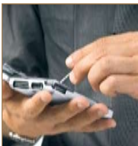
Handheld devices allow more efficient routing for Swingle's technicians.

Dig into your job and you'll likely blossom personally and professionally. You're going to learn a lot. You're going to stay busy year-round with new challenges. You're going to see the results of your efforts in the form of beautiful green things (and by that we don't just mean money).