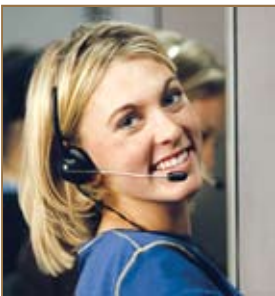
Renowned customer care service starts with the very first phone call.

The name of our company, Swingle Lawn, Tree & Landscape Care, ends with the word "care." When it comes to doing business, it begins just the same.