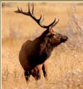
Bull Elk grazing in a Colorado high country meadow.