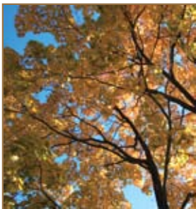
Trees towering in Denver's neighborhoods planted by John Swingle decades ago.