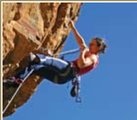
Colorado offers superb rock climbing on ancient canyon walls and cliffs.