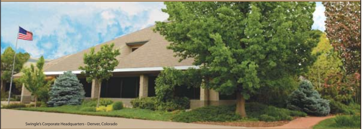
Swingle's Corporate Headquarters - Denver, Colorado